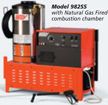
Model 982SS with Natural Gas Fired combustion chamber

Upright, oil fired burner delivers high efficiency and maintains constant temperature using diesel fuel, kerosene or home-heating oil