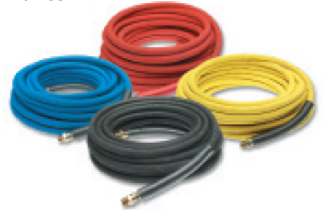
High-pressure hoses from 30 to 150-ft. lengths